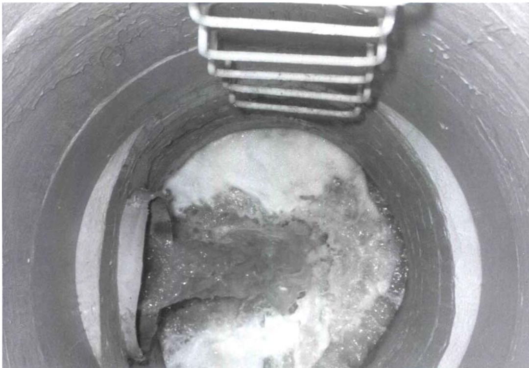
Figure 1A. Urethane coating applied to a drop manhole.