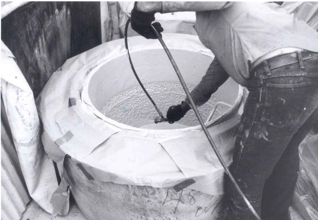
Figure 6. Spraying a coating on a test tank.