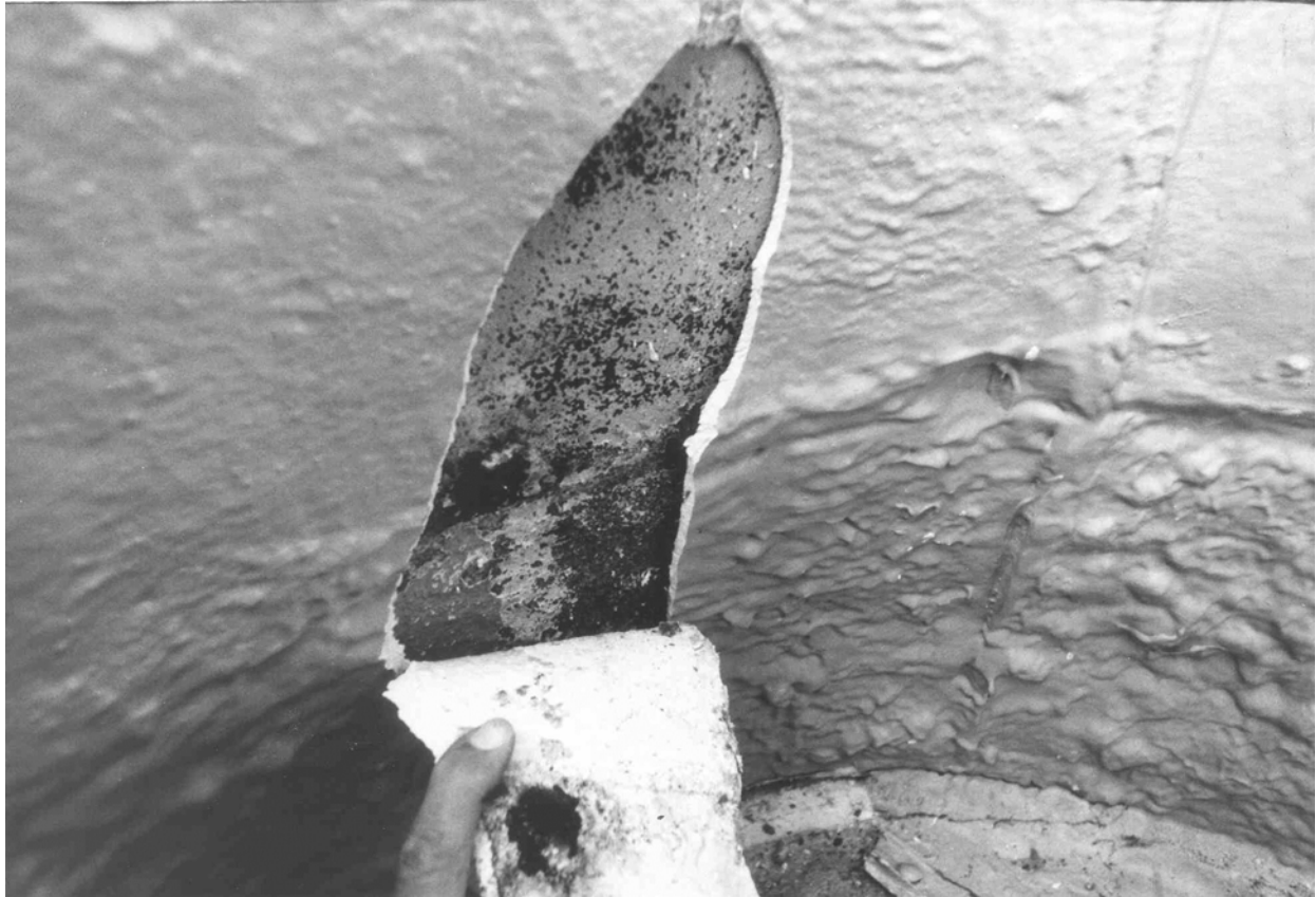
Figure 8. Section of urethane coating pulled from a test tank wall.

C-48, C-52, C-60, C-71, and C-92) were resistant to sulfuric acid, but only two coating systems (C-10 and C-71) provided a tenacious bond to the concrete substrate, and a relatively pinhole free surface.