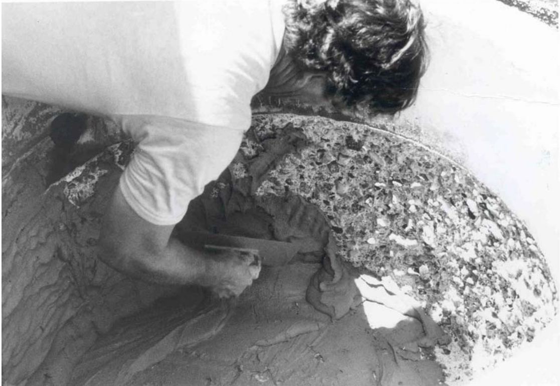
Figure 5. Surface repair to the corroded portion of the test tank.