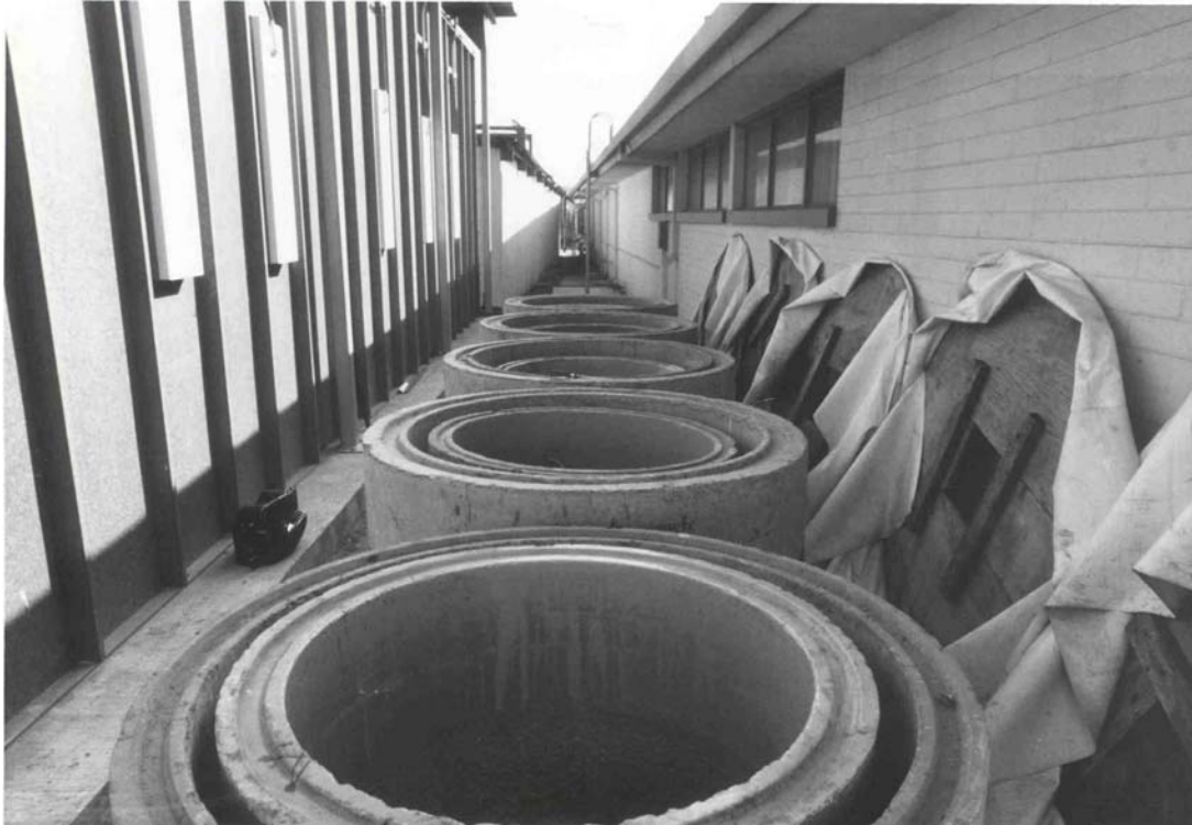
Figure 3. Five test tanks.