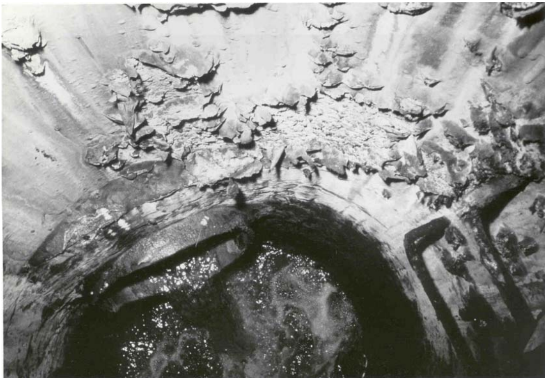
Figure 1B. Urethane coating failure after two years.