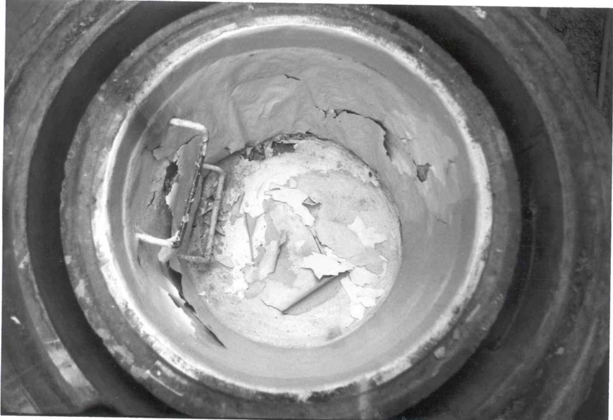
Figure 7. Epoxy coating failure.

Figure 7 illustrates the coating failure that occurred after only a short time period to one epoxy coating (C-7). Preliminary tests with ingots of one system (C-23) looked promising, but the manufacturer decided to use a non-epoxy coating system in the evaluation. Lack of sufficient acid resistance and inability to protect the concrete from corrosion plagued the other systems (C-14, C-19, and C-21).