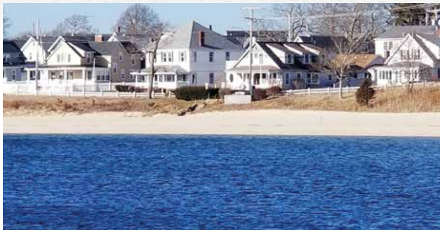
Wareham is a densely populated beachfront community with narrow streets

Serious structural integrity issues were found within an 18/21-inch reinforced concrete pipe (RCP) interceptor that carries flow from the western side of the Town around marshes and waterways within the Town boundaries. The deteriorated sections of RCP showed visible spalling, deposited aggregate from infiltration, root infiltrations, and exposed structural reinforcement. These sections of interceptor were clearly weakened and urgently needed repair. Additionally, manholes along this 1.8-mile interceptor were structurally compromised, showing signs of