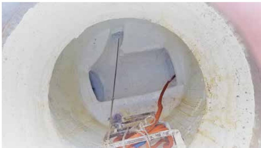
The 39 manholes along the 1.8 mile segment were coated with an aquatic-safe epoxy

Locally approved Warren Environmental, A&W Maintenance, and subcontractor SAK Construction, overcame tremendous challenges during installation of the liner, including managing major infiltration leaks at several pipe locations. Prior to installation, grouting was applied to these areas in order to stop the leakage.