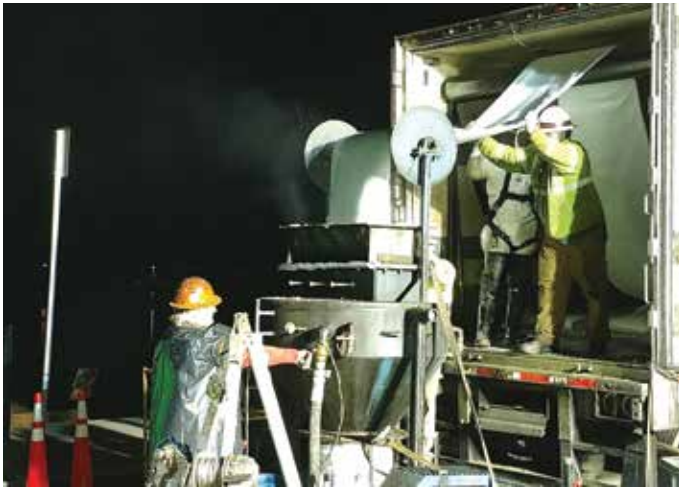
To reduce traffic disruption in downtown Wareham, CIPP liner was installed at night