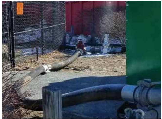
Bypass setup pumped over 110,000 gallons average daily flow

In order to protect the surrounding environment from erosion runoff coming from the construction site, straw wattles were installed around the salt marshes, cranberry bogs, and ecologically sensitive bays.