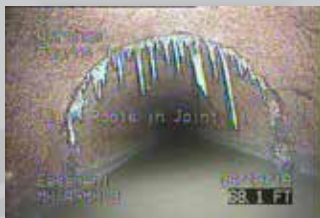
Roots at Joints