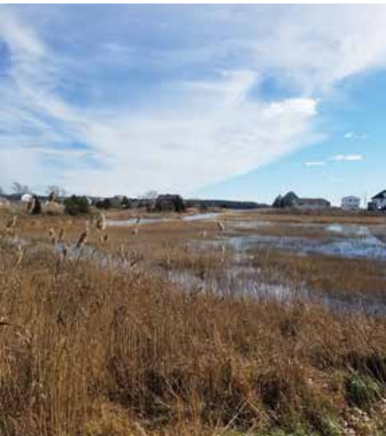
Protection of the marshes and waterways was of vital importance