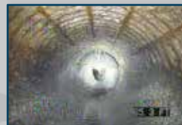
High Street: Downstream of Kennedy Pump Station ~ (604,500 Gallons per Day)