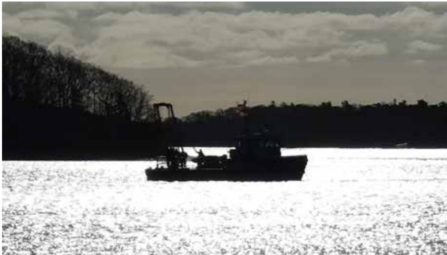
Selection of the aquatic-safe CIPP system guaranteed protection of the local ecology

of local residents. By rehabilitating this critical length of interceptor, the Town of Wareham, in collaboration with BETA Group, Inc., A&W Maintenance, SAK Construction, and Warren Environmental, was able to create an ecologically harmless monolithic lining system which will protect the Town's sanitary sewer system and surrounding environment for many years to come.