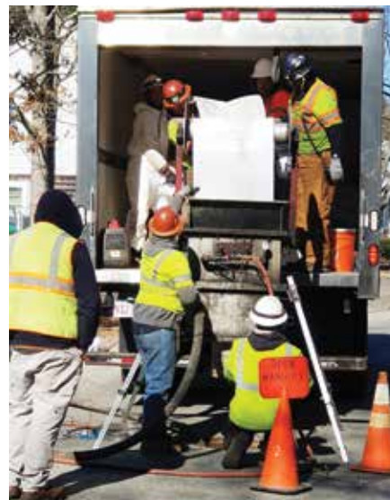
Compact site footprint during liner installation minimized impact on the community

A low toxicity aquatic safe epoxy CIPP lining technology supplied by Warren Environmental was selected, along with a structural glass and felt liner which had passed third-party ASTM testing. The epoxy resin selected was zero VOC, 100